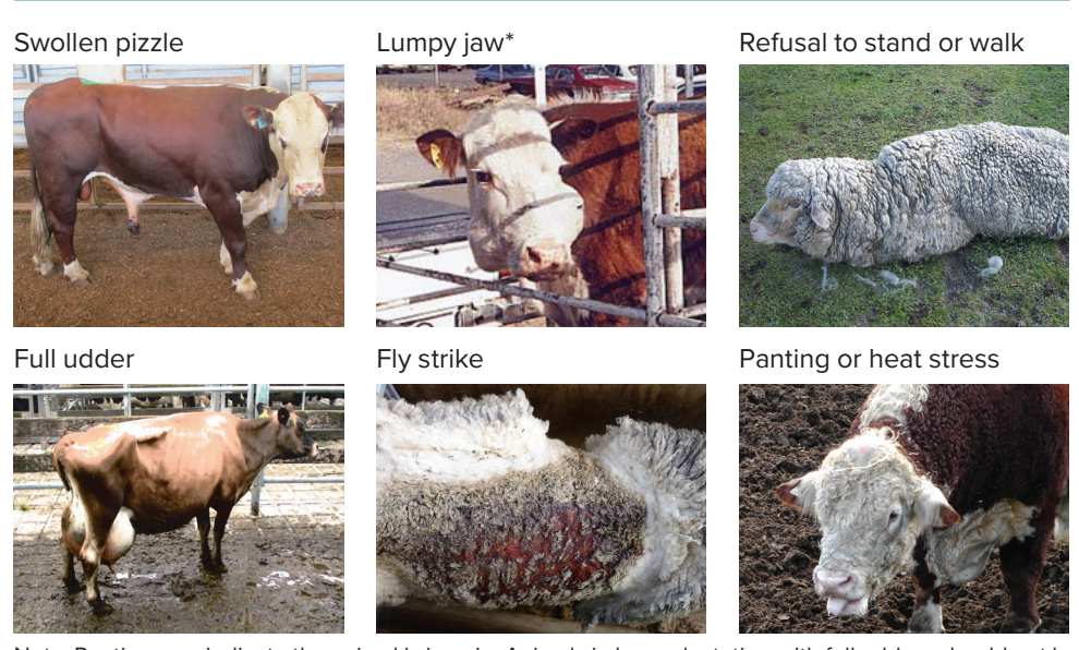
Note: Panting may indicate the animal is in pain. Animals in heavy lactation with full udders should not be transported.