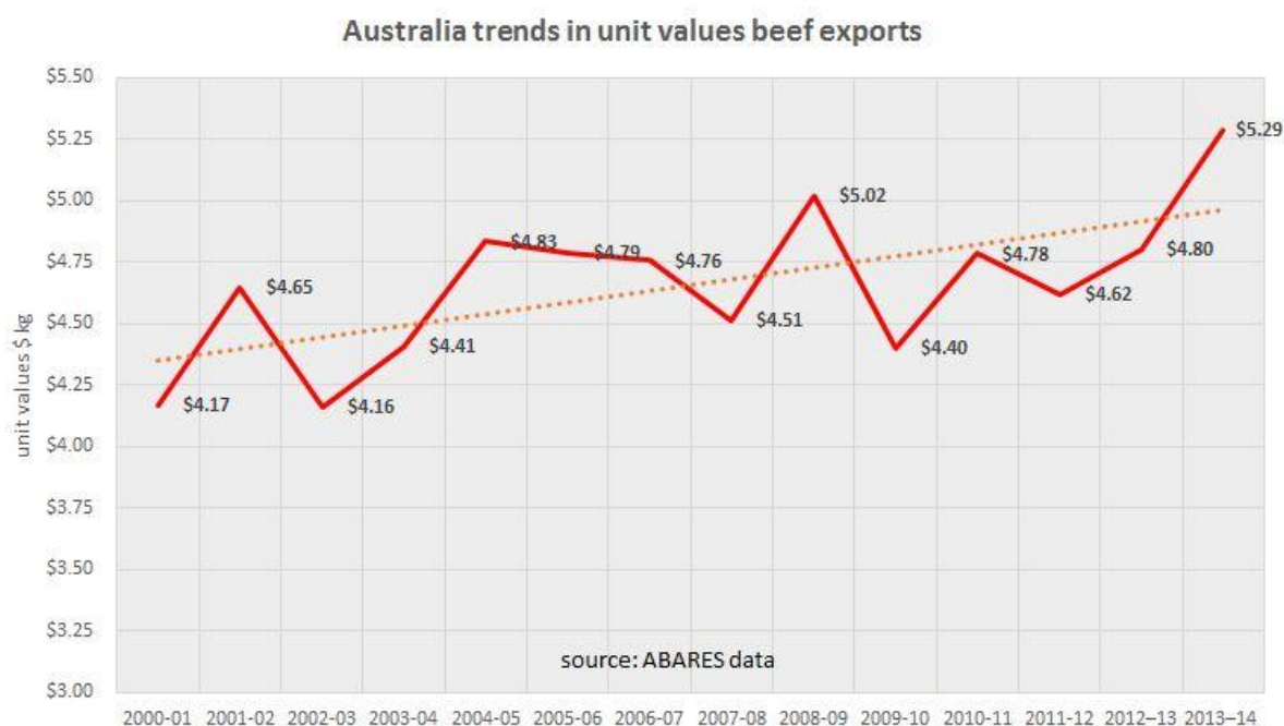
Figure 1 Australia trends in unit values beef exports

Australian trend beef export values since 2000 have undergone a series of setbacks due to trade disruptions with BSE issues in North America and Japan and later the global financial crisis.