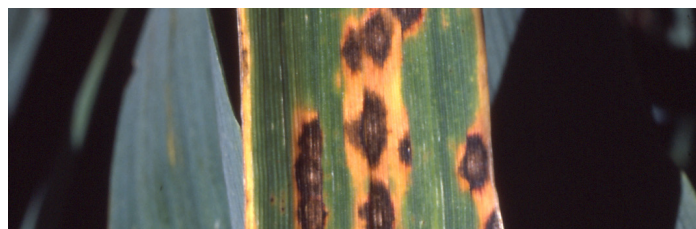
Figure 7: Septoria blotch on oats

The symptoms first appear on leaves as small, dark-brown spots. Spots develop into larger, oval-shaped blotches, surrounded by light-brown margins. Infection may spread to the leaf sheaths and stems resulting in lodging.