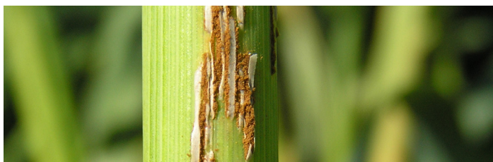
Figure 5: Stem rust on oat stems