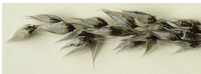
Figure 9: Loose smut on oats

Any seed that may be used for seed crops should be treated with a suitable fungicide before planting. Check to see if seed has been treated. If not, dress with Vitavax, Vitaflo or another registered seed treatment. Check the chemical label for details.