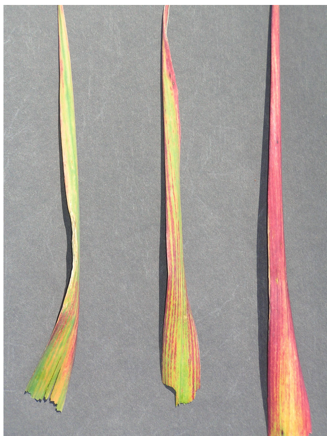
Figure 1: Red-tipping in oats

Red-tipping can be avoided by practising good crop nutrition. In paddocks with a history of this problem, increase nitrogen rates to 70–80 kg of nitrogen per hectare and check whether other nutrients are adequate. Top-dressing can be used to correct the problem, but good rainfall after application is necessary and, as a consequence, results can be erratic.