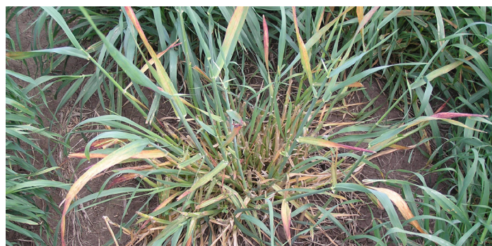
Figure 8: Barley yellow dwarf virus on oats

Insecticidal seed dressings can be used to control aphids in the seedling stage and reduce BYDV infection. Control of alternate aphid hosts and good crop nutrition will prevent infection and reduce yield loss.