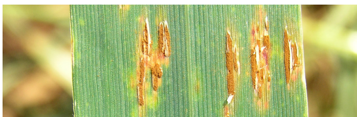
Figure 4: Stem rust on oat leaves

No resistant varieties are available—all varieties in Australia are susceptible. As with leaf rust, many different races of stem rust are present in Australia, and each race will often occur on one variety only.