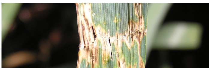
Figure 6: Bacterial blight on oats

The disease spreads by raindrop splash or mechanical means, and survives on seed and plant stubble. Bacterial blight is controlled by grazing to remove infected plant tissue (seed treatment is not effective).